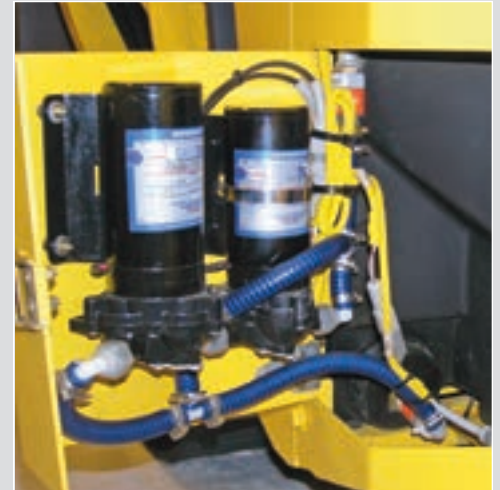
Dual water spray pumps, providing back-up provision.