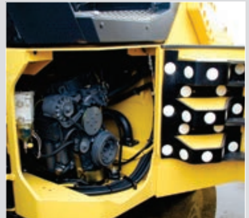
Large swing open doors for easy access to service and maintenance checkpoints.