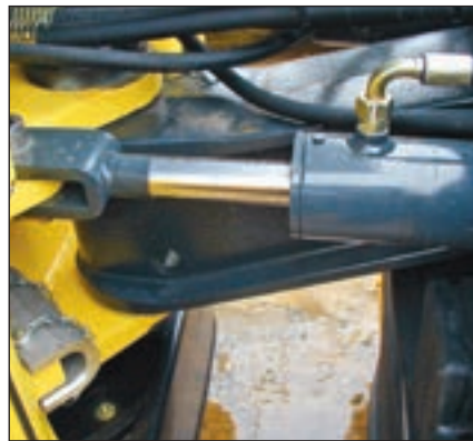
Bolt-in heavy duty oscillating / articulating centerjoint with 6.7 inches offset provision.