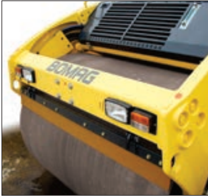
Slanted leg design offers exceptional visibility to both drum work surface, water spray system and surrounding jobsite area.