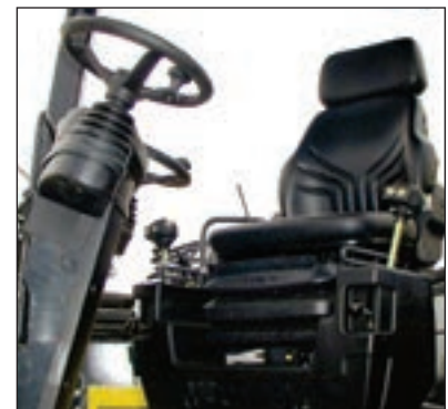
BW 141AD-4 / BW 151AD-4 Operator's platform with sliding/swiveling seating position