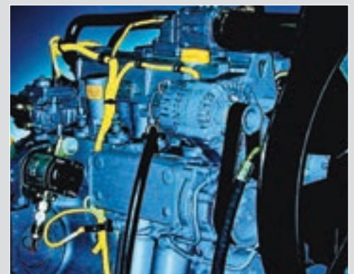
Powerful and fuel efficient Deutz water-cooled diesel engine.

With these features and many more, it's easy to see why these models maintain a high residual value while delivering lower lifetime operating costs.